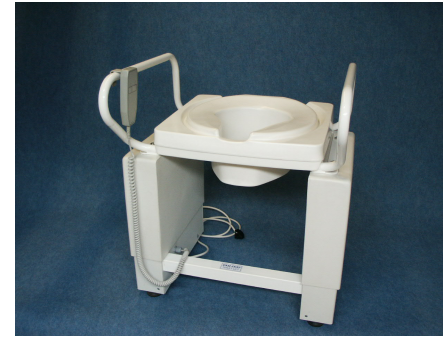
Easi-Seat "Standard" Model—Page 4