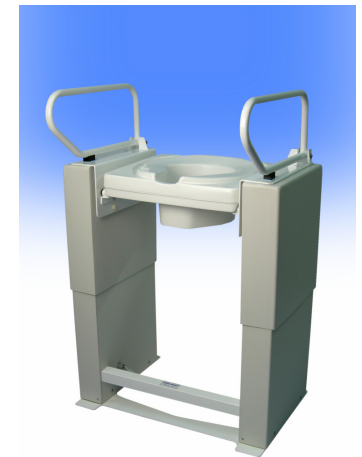
Extra High Lift.....