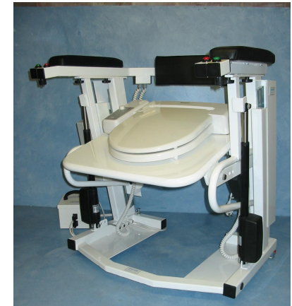
Easi-Seat— " HD 45 " Model—Page 6